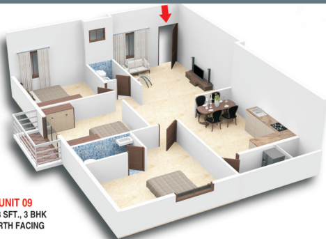
UNIT 09 1293 SFT., 3 BHK NORTH FACING