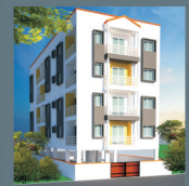
NANDINI GOLDEN NEST