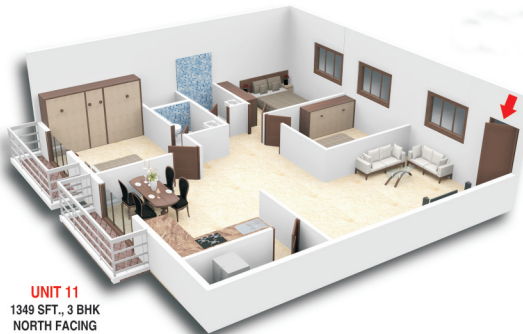
UNIT 11 1349 SFT., 3 BHK NORTH FACING