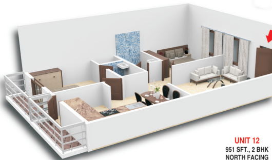
UNIT 12 951 SFT., 2 BHK NORTH FACING