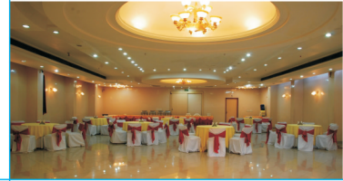
Multi purpose hall