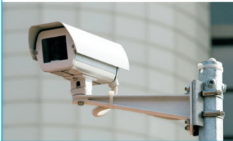
CCTV Surveillance in common area