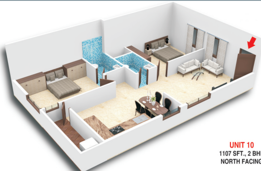
UNIT 10 1107 SFT., 2 BHK NORTH FACING