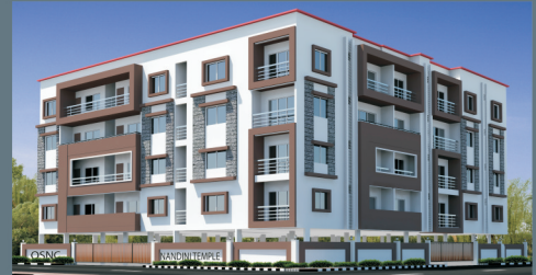
NANDINI TEMPLE VIEW