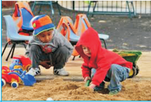
Children play area